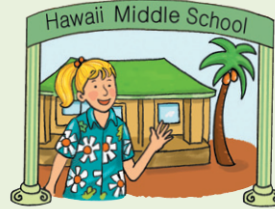
in the second grade