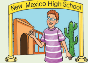
in the third grade

Specialty I am good at Math. I am best at Math.