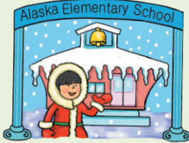
in grade 1